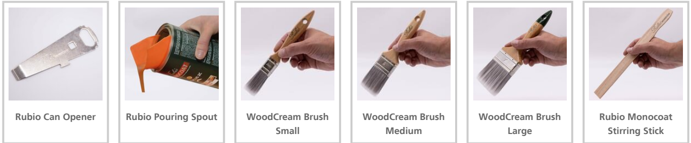
Rubio Can Opener